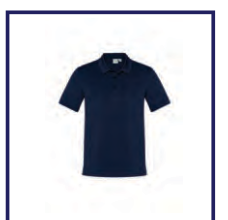
CODE: P1N LADIES/MENS NAVY