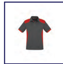
CODE: P2GR LADIES/MENS GREY RED