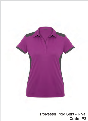
Polyester Polo Shirt - Rival Code: P2