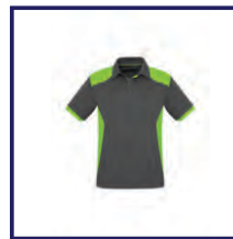
CODE: P2GF LADIES/MENS GREY / FLUORO LIME