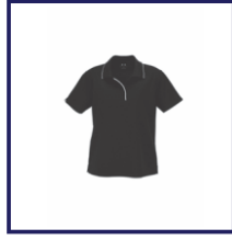
CODE: P6B LADIES/MENS BLACK WHITE