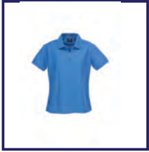
CODE: P5A LADIES/MENS AZURE BLUE