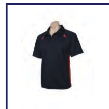
CODE: P3NR MENS ONLY NAVY RED