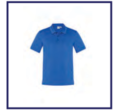
CODE: P1E LADIES/MENS ELECTRIC BLUE