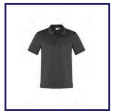
CODE: P1B LADIES/MENS BLACK