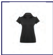
CODE: P2BW LADIES/MENS BLACK WHITE