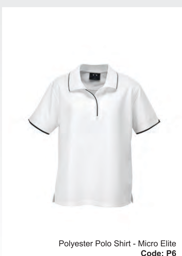
Polyester Polo Shirt - Micro Elite Code: P6