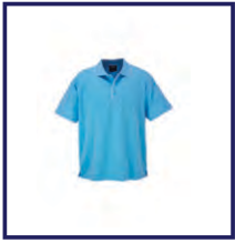
CODE: P6A LADIES/MENS AQUA WHITE