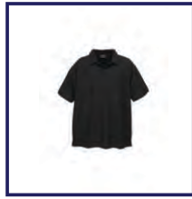
CODE: P5B LADIES/MENS BLACK