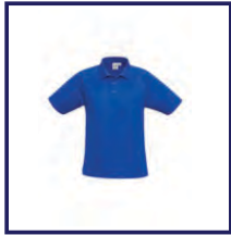
CODE: P4RL LADIES/MENS ROYAL