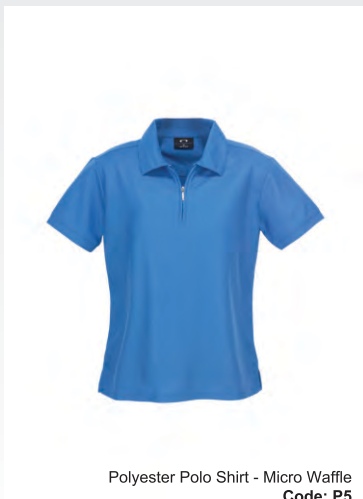
Polyester Polo Shirt - Micro Waffle Code: P5