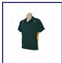
CODE: P3FG MENS ONLY FOREST GOLD