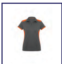
CODE: P2GO LADIES/MENS GREY ORANGE