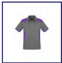
CODE: P2SP LADIES/MENS SILVER PURPLE