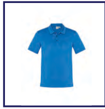
CODE: P1C LADIES/MENS CYAN