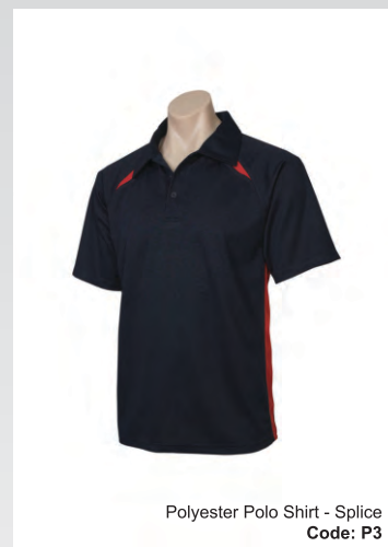
Polyester Polo Shirt - Splice Code: P3