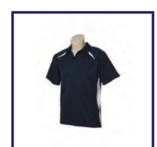
CODE: P3NW MENS ONLY NAVY WHITE