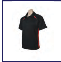
CODE: P3BR MENS ONLY BLACK RED