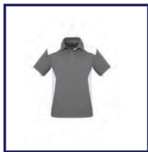
CODE: P2SW LADIES/MENS SILVER WHITE