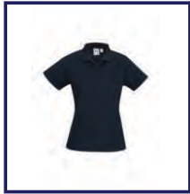
CODE: P4N LADIES/MENS NAVY