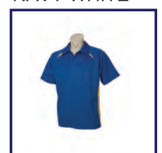
CODE: P3RG MENS ONLY ROYAL GOLD