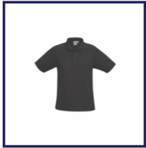
CODE: P4B LADIES/MENS BLACK