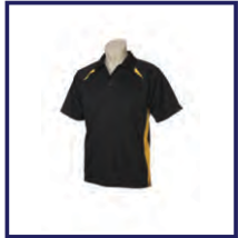
CODE: P3BG MENS ONLY BLACK GOLD