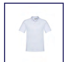
CODE: P1W LADIES/MENS WHITE