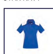
CODE: P2RW LADIES/MENS ROYAL WHITE