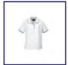
CODE: P6W LADIES/MENS WHITE BLACK