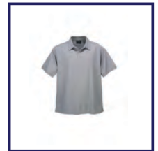
CODE: P5S LADIES/MENS SILVER GREY