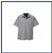
CODE: P6S LADIES/MENS SILVER GREY WHITE