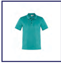
CODE: P1T LADIES/MENS TEAL