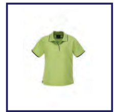
CODE: P6P LADIES/MENS PISTACHIO NAVY