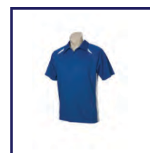
CODE: P3RLW MENS ONLY ROYAL WHITE