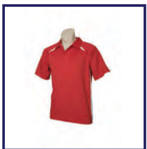
CODE: P3RW MENS ONLY RED WHITE