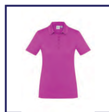
CODE: P1M LADIES ONLY MAGENTA