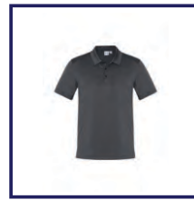
CODE: P1CH LADIES/MENS CHARCOAL