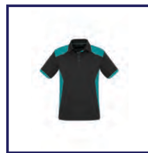
CODE: P2BT LADIES/MENS BLACK TEAL