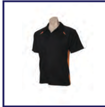
CODE: P3BO MENS ONLY BLACK ORANGE