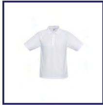
CODE: P4W LADIES/MENS WHITE