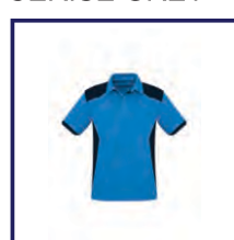
CODE: P2CN LADIES/MENS CYAN NAVY