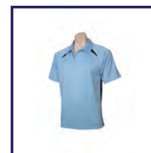
CODE: P3SW MENS ONLY SPRING BLUE WHITE