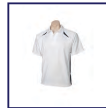
CODE: P3WN MENS ONLY WHITE NAVY