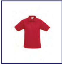
CODE: P4R LADIES/MENS RED