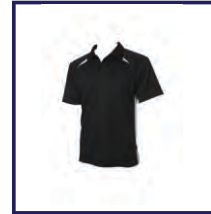
CODE: P3BW MENS ONLY BLACK WHITE