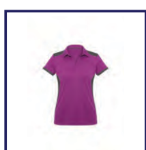
CODE: P2CG LADIES/MENS CERISE GREY