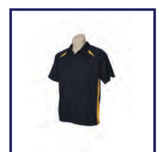
CODE: P3NG MENS ONLY NAVY GOLD