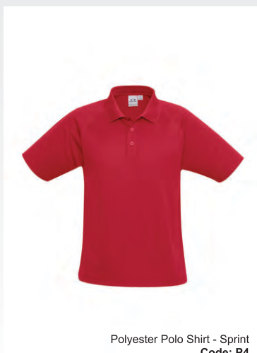
Polyester Polo Shirt - Sprint Code: P4