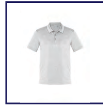
CODE: P1S LADIES/MENS SILVER