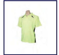
CODE: P3FB MENS ONLY FLOURESCENT BLACK