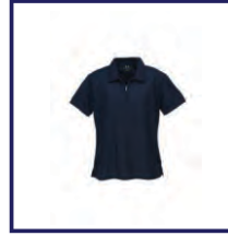
CODE: P5N LADIES/MENS NAVY