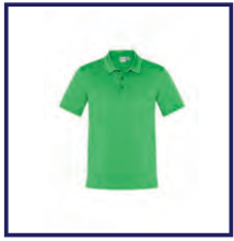
CODE: P1L LADIES/MENS LIME