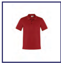
CODE: P1R LADIES/MENS RED