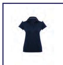
CODE: P2NW LADIES / MENS NAVY WHITE