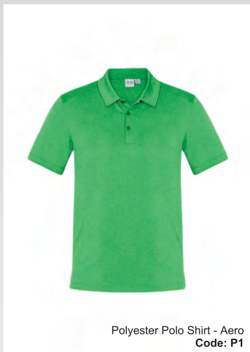
Polyester Polo Shirt - Aero Code: P1