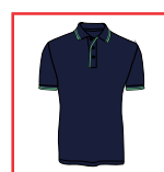
CODE: NF2 MENS ONLY NAVY/GREEN