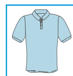
CODE: L1 LADIES/MENS LIGHT BLUE