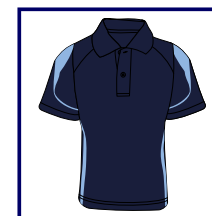
CODE: NL3 MENS ONLY NAVY/LIGHT BLUE