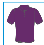
CODE: S1 LADIES MULBERRY