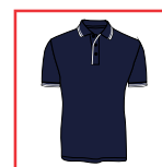
CODE: NW2 LADIES/MENS NAVY/WHITE