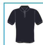
CODE: N1 LADIES/MENS NAVY