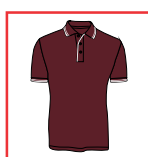
CODE: MW2 MENS MAROON/WHITE