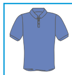
CODE: I1 LADIES IRIS