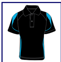
CODE: BU3 LADIES/MENS BLACK/AQUA