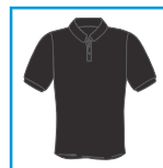
CODE: Q1 LADIES/MENS GUN METAL