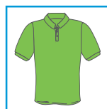
CODE: E1 LADIES/MENS PEA GREEN