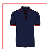
CODE: NC2 MENS NAVY/RED