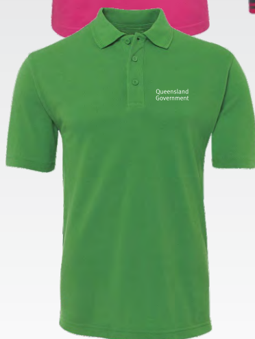
Plain Cotton Blend Polo Shirt Code: E1 Pea Green