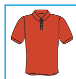
CODE: O1 MENS ORANGE