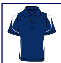
CODE: RW3 MENS ROYAL/WHITE