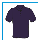
CODE: P1 LADIES/MENS PURPLE