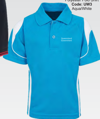
Polyester Polo Shirt Code: UW3 Aqua/White