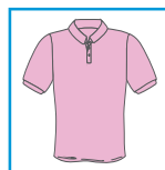
CODE: X1 LADIES ONLY MUSK