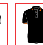
CODE: BO2 MENS ONLY BLACK/ORANGE