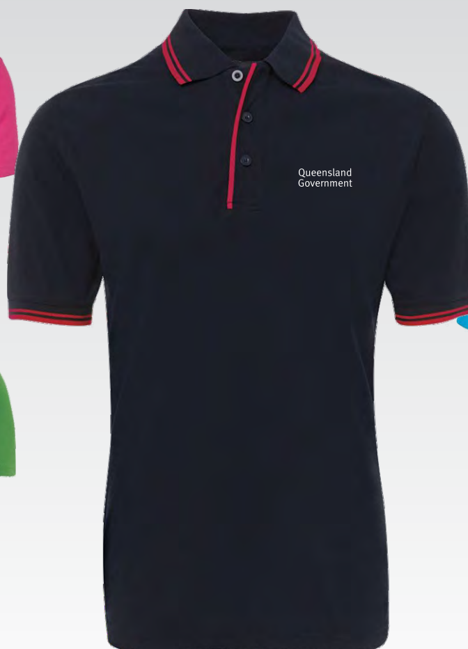
Contrast Trim Cotton Blend Polo Shirt Code: NC2 Navy/Red