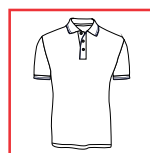
CODE: WN2 LADIES/MENS WHITE/NAVY