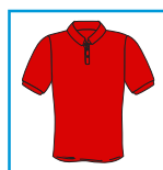
CODE: C1 LADIES/MENS RED