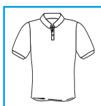
CODE: W1 LADIES/MENS WHITE