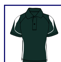
CODE: FW3 MENS ONLY BOTTLE GREEN/WHITE