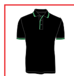
CODE: BE2 MENS BLACK/PEA GREEN