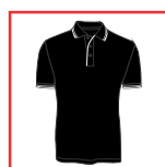
CODE: BW2 LADIES/MENS BLACK/WHITE