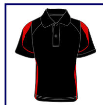
CODE: BC3 LADIES/MENS BLACK/RED