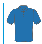
CODE: R1 LADIES/MENS ROYAL