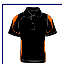
CODE: BO3 MENS ONLY BLACK/ORANGE