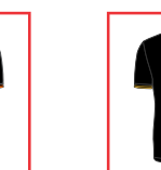
CODE: BY2 MENS ONLY BLACK/GOLD