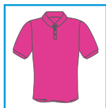
CODE: Z1 LADIES/MENS HOT PINK