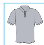
CODE: G1 MENS ONLY GREY