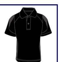
CODE: BQ3 MENS ONLY BLACK/CHARCOAL