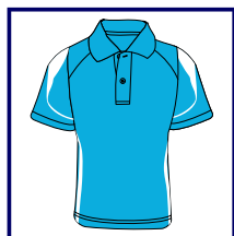
CODE: UW3 LADIES/MENS AQUA/WHITE