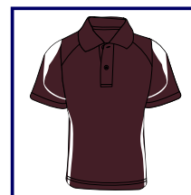
CODE: MW3 MENS ONLY MAROON/WHITE