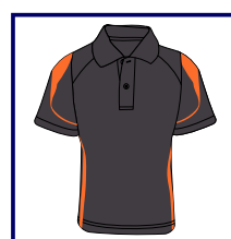
CODE: QO3 MENS ONLY CHARCOAL/ORANGE