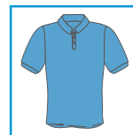
CODE: U1 LADIES/MENS AQUA