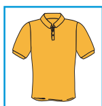
CODE: Y1 MENS GOLD