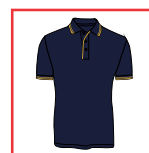
CODE: NY2 MENS NAVY/GOLD