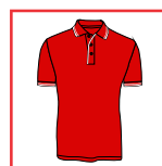
CODE: CW2 LADIES/MENS RED/WHITE