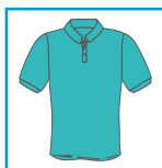
CODE: J1 LADIES/MENS JADE