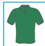
CODE: A1 LADIES/MENS KELLY GREEN