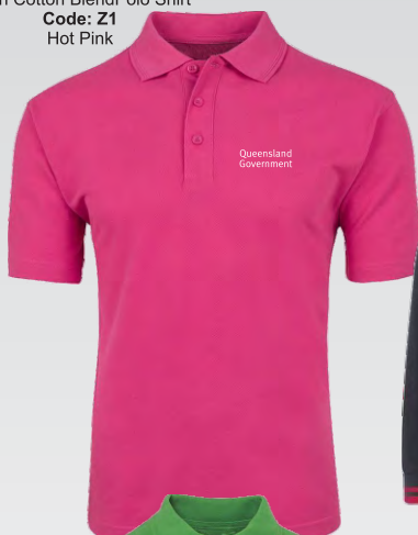
Plain Cotton Blend Polo Shirt Code: Z1 Hot Pink