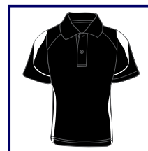
CODE: BW3 LADIES/MENS BLACK/WHITE