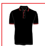
CODE: BC2 LADIES/MENS BLACK/RED