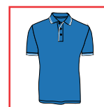
CODE: RW2 LADIES/MENS ROYAL/WHITE