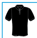
CODE: B1 LADIES/MENS BLACK