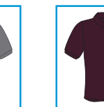
CODE: M1 MENS ONLY MAROON