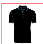
CODE: BU2 MENS BLACK/AQUA