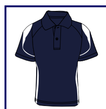
CODE: NW3 LADIES/MENS NAVY/WHITE