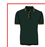
CODE: FY2 MENS ONLY BOTTLE GREEN/GOLD