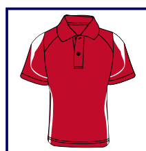
CODE: CW3 MENS RED/WHITE