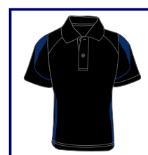
CODE: BR3 MENS ONLY BLACK/ROYAL