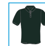
CODE: F1 MENS ONLY BOTTLE GREEN