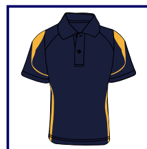
CODE: NY3 MENS ONLY NAVY/GOLD