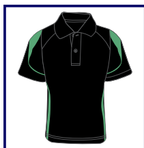
CODE: BE3 LADIES/MENS BLACK/PEA GREEN